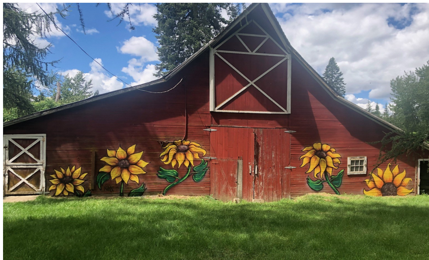
Photo is of Glen and Betsy Rothrock's historic barn off Garwood Road. She said it was built 80 to 100 years ago. The sunflowers were painted by their niece last summer.

Today's modern barns still serve the purpose of sheltering our animals, storing our crops and keeping our equipment under cover.